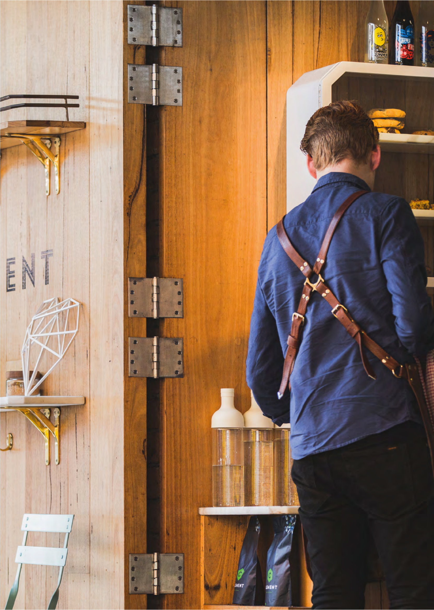
Clement South Melb Market.