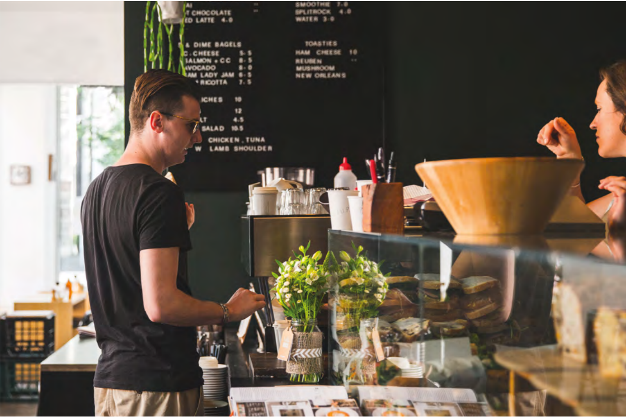
Bellota Wine Bar. Bank St.